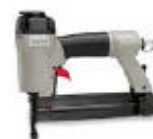
Porter-Cable 18 ga. Brad Nailer