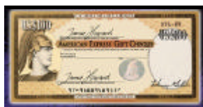
$100 AmEx Gift Cheque