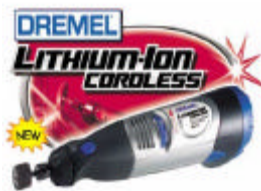
Dremel #8000-01 & Kit Combo